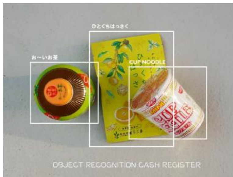
The system recognizes multiple overlapping items at checkout

Utilizing Kyocera's proprietary AI architecture, the system can register and recognize more than 6,000 different types of products. Adding products to the database requires the system only to learn the latest product, whereas other AI -based checkout systems available on the market would need to re-learn all products, leading to a reduction in learning time.