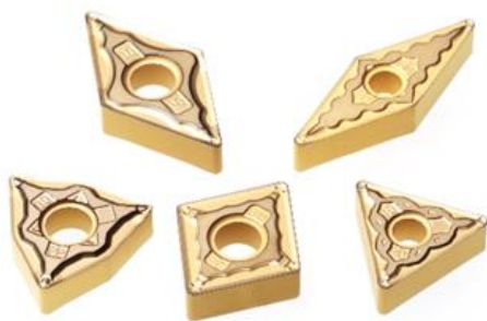
Carbide inserts with new coating material CA025P

Steel is often used in numerous industries including automotive and industrial machining. There is a growing demand for long-lasting inserts with excellent resistance against wear, fracturing and chipping capable of stable machining performance over a wide range of cutting conditions. Kyocera's new industrial cutting tool series features multilayer CVD coatings with a layer using a thick film of aluminum oxide (Al 2 O 3 ) for excellent heat resistance. Utilizing cemented carbide as a base material ensures excellent fracture resistance, long-term performance, and longer tool life. These new cutting tools can accommodate a wide range of machining applications from roughing to finishing by using a variety of chipbreakers. Kyocera aims to support customers by reducing the frequency of insert replacements and improving production yield.